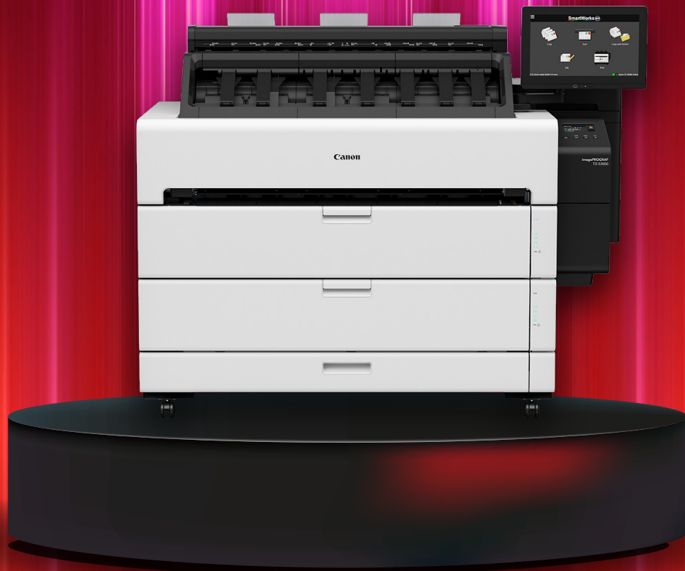
imagePROGRAF TZ-32000 MFP Z36